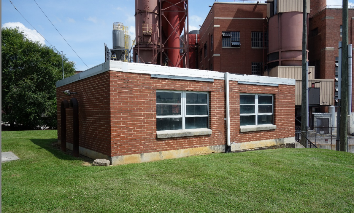
North and West Elevation