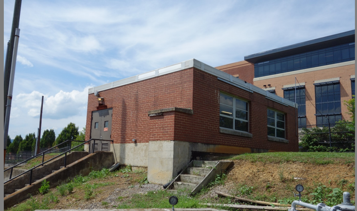
South and East Elevation

Demolition of Oil Storage Pump House, Building 0205